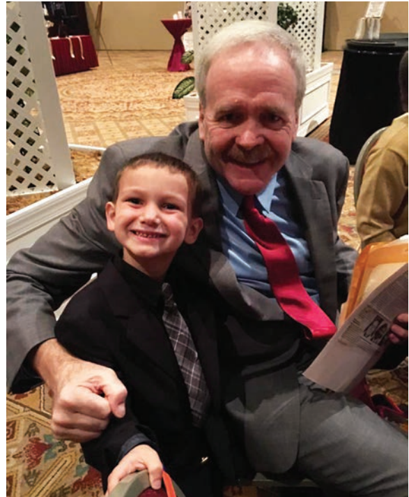
Each year at the Dan Patch Awards, HHYF and the US Harness Writers Association partner in a silent auction fundraiser.