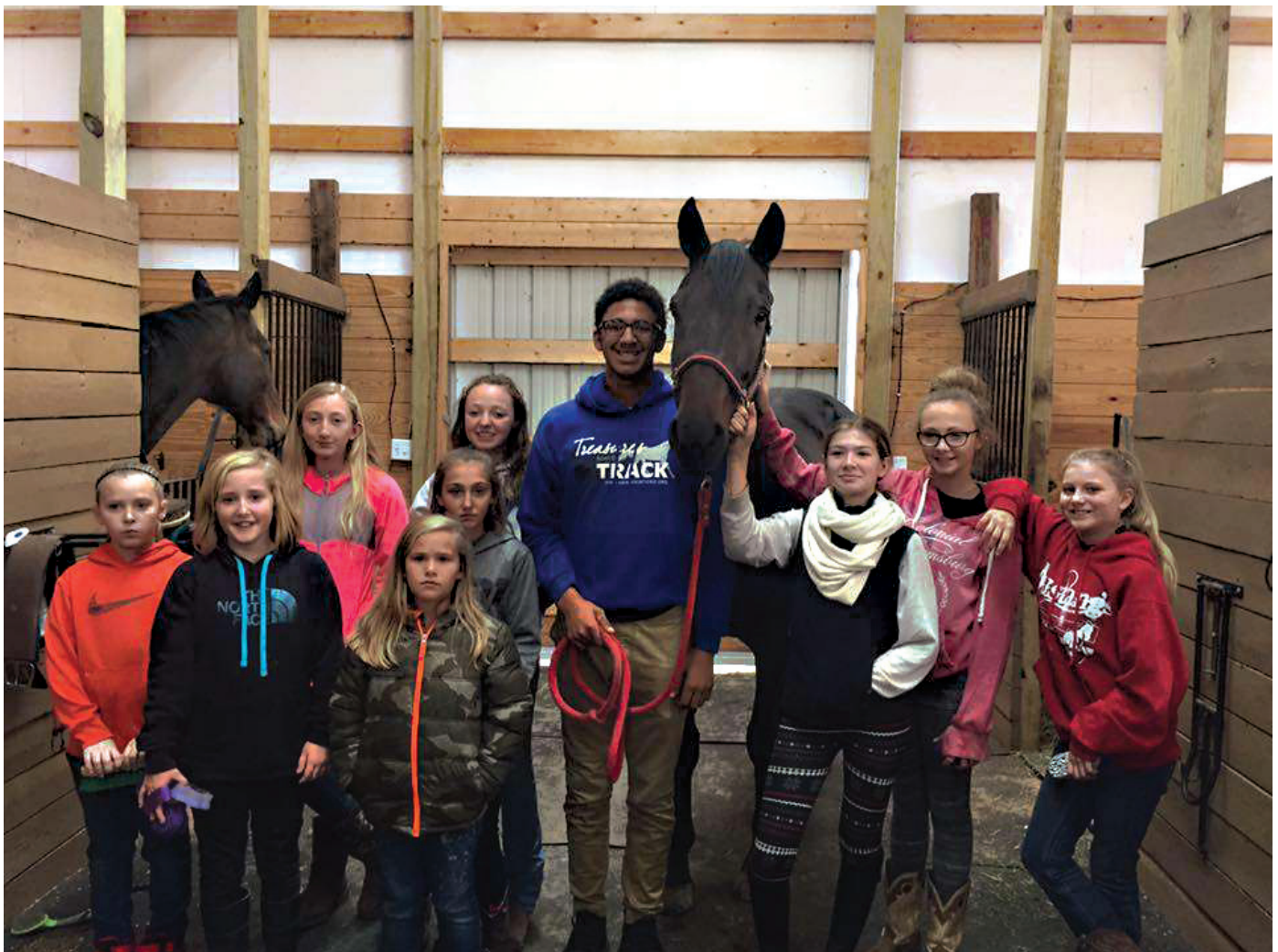
Retired Standardbred All American Legacy with his Blazin' Bridles 4-H group friends.