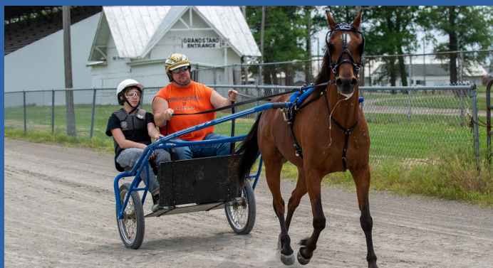
Van Wert County Fairgrounds, Van Wert OH - May 21