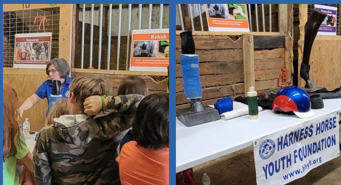
Harrison County Ag Days, Corydon, IN - May 5 & 6, October 5 & 6

Once again, HHYF was on the road from early May to early October. Here are the details and photos which help capture the spring/summer/fall experiences.