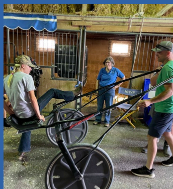
Harrington Raceway, Harrington DE - June 27