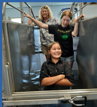
Crimson Lane Farm, Anderson IN July 10 - 14: Leadership Program