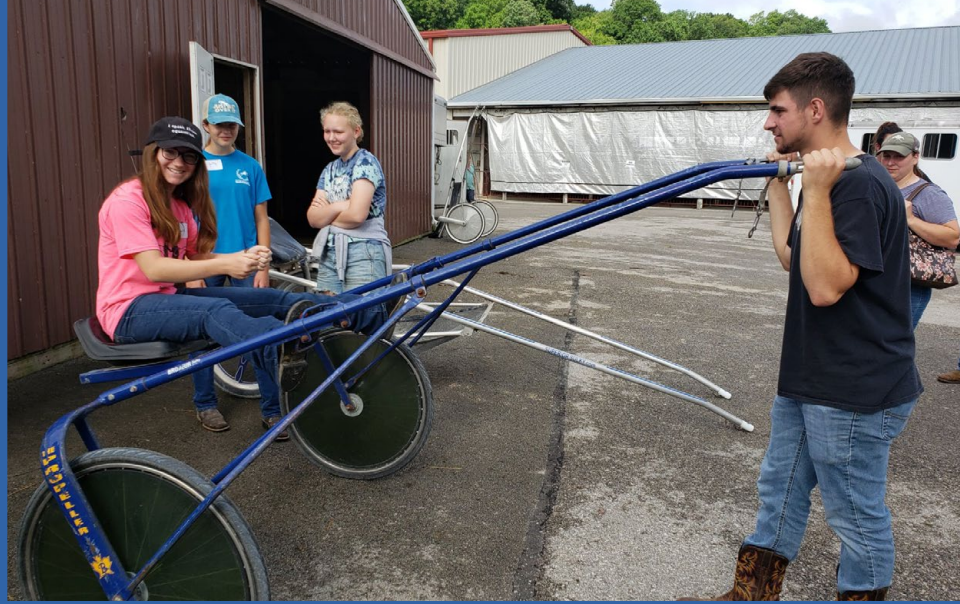
Harrison County 4-H, Corydon IN