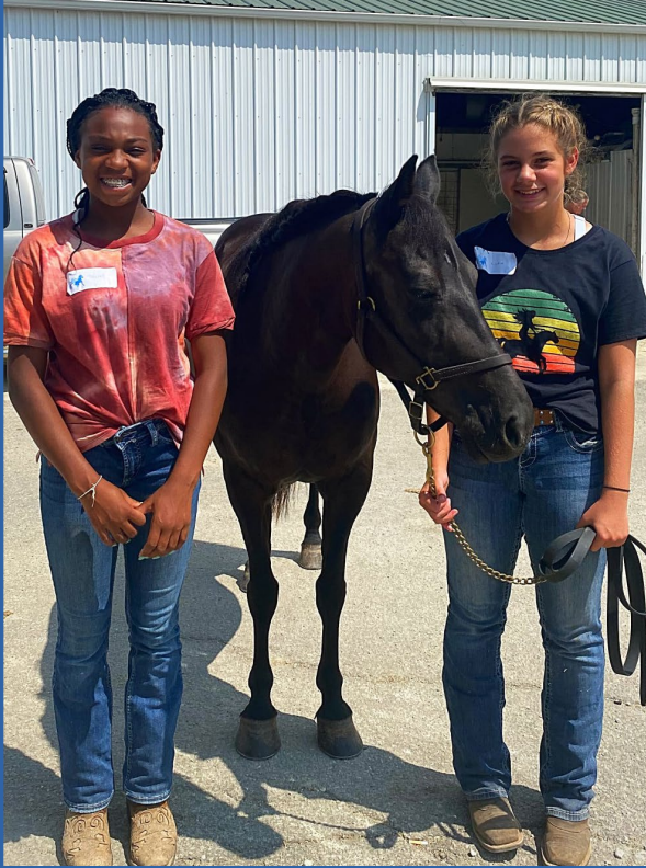
Jay County Fairgrounds, Portland IN