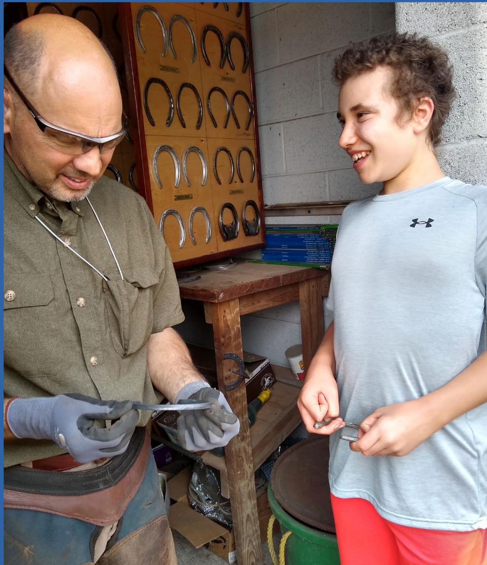
The Red Mile, Lexington KY