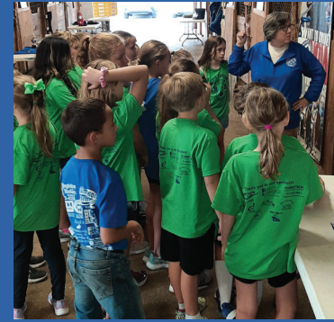
Harrison County Ag Days in Corydon IN is always fun! We compare race horses and drivers to human athletes!