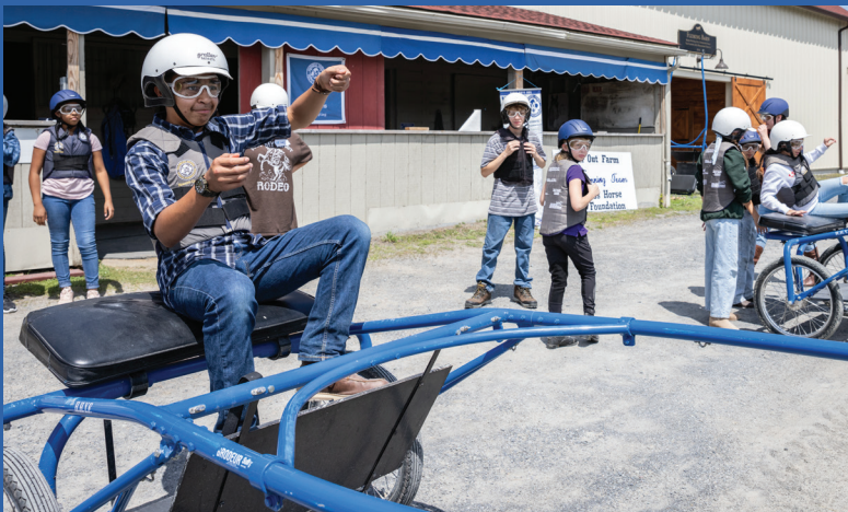
Trying the jog cart proper mount and arm extension just before the real jogging begins at Goshen Historic Track.