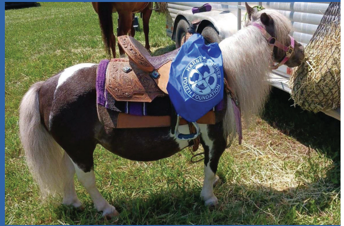
Moonsville Conservation Club was just one of many organizations who requested HHYF care packages. Doesn't this little guy carry it well?