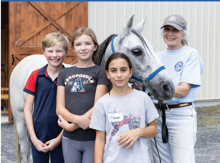
A group photo after a great day at HHYF in Goshen NY!