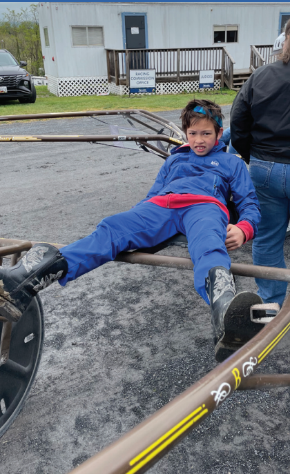
Sometimes it's a strettchhh but comparing jog carts and race bikes is always interesting!