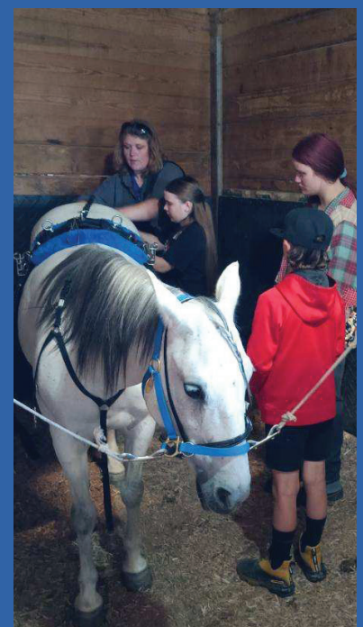
C J repeats one of THE most important parts of harnessing is to make sure there is no tail hair caught under the crupper.