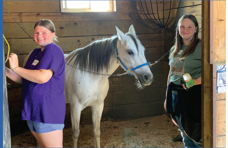
Aren't these smiles wonderful, and a big part of what HHYF is all about?