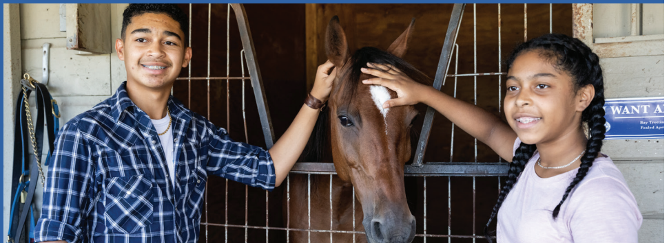
2023 HHYF mission complete: happy campers and new fans for harness racing!