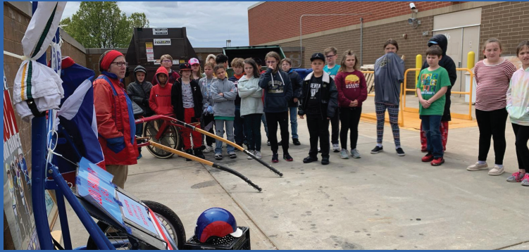
Prairie Crossing Elementary School in Oxford IN in conjunction with Life & Times of the Great Dan Patch Festival!