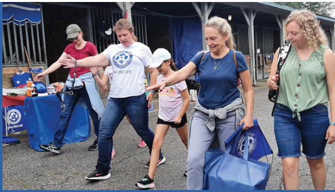
Learning by doing...practicing pacing at Breyerfest in Lexington.