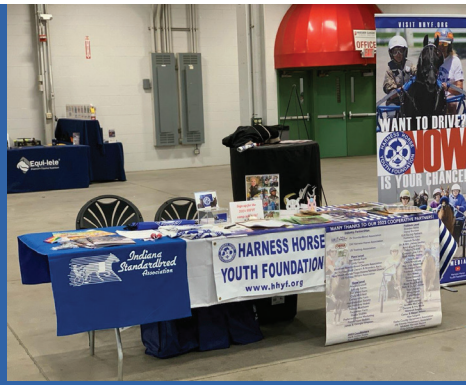
The lull before the charge of young Amish kids asking for HARNESS HEROES packs at the Hoosier Classic Sale.