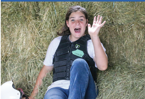
Not much time to rest at HHYF!