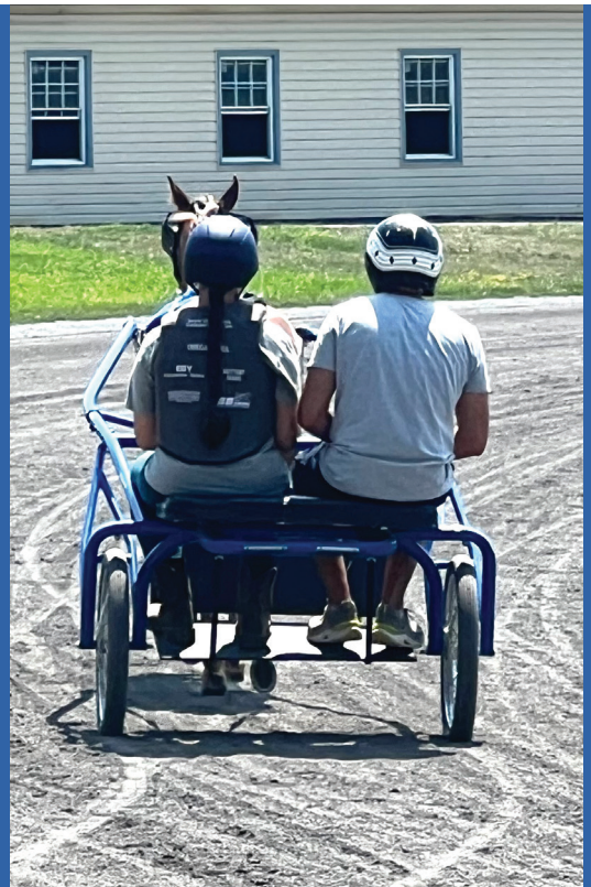
Onward! An interesting angle of track time at Gaitway Farm during jogging.