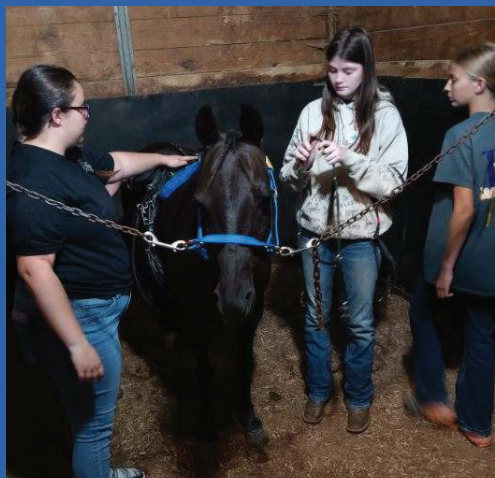
Is everyone ready for a surprise quiz on harness parts?