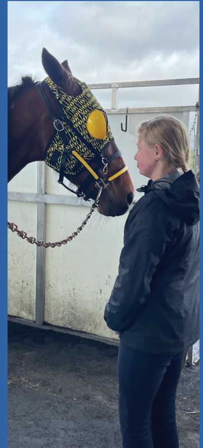
Instant connections are often the case as at Shenandoah Downs in April.