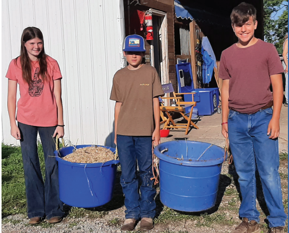
Teamwork makes dreamwork, especially at the Leadership Program which is a sleepover 5-day, 4-night camp jammed full of field trips as well as doing barn work for "their" stable!