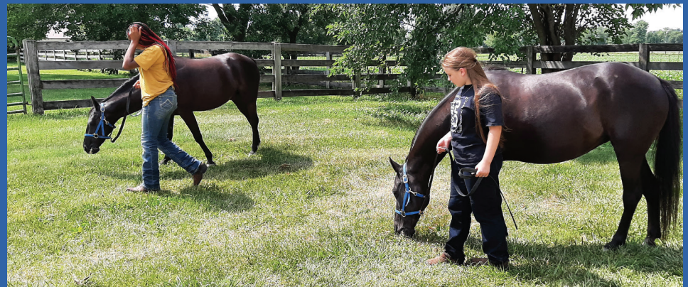
Roy and Homer enjoy some afternoon grass with their HHYF caretakers at Crimson Lane Lane Farm, host of this year's Leadership Program.