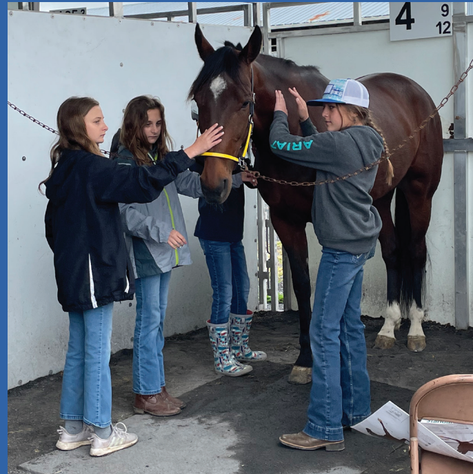
"I think I like these girls and the attention" says the horse used for the harnessing demonstration in VA!