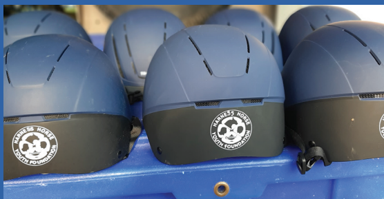
Thanks to the USA Equestrian Trust grant, HHYF purchased 9 new helmets this year.