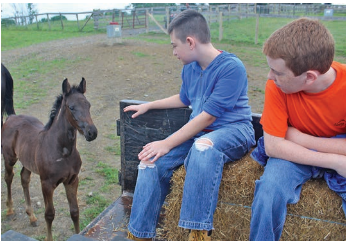
Leadership Camp - July 4 – 7 This year, Leadership included a field trip to Cameo Hills Farm to see the breeding side of harness racing – fun to see the mares and inquisitive foals!