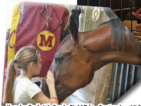
Hoosier Park 4th Grade Field Trip - September 18 & 19

Another 600 new fans for harness racing - kids enjoyed designing their own colors, learning how to "dress" the racehorse, all about managing the equine athlete, and cheering for their horses in the mock race!