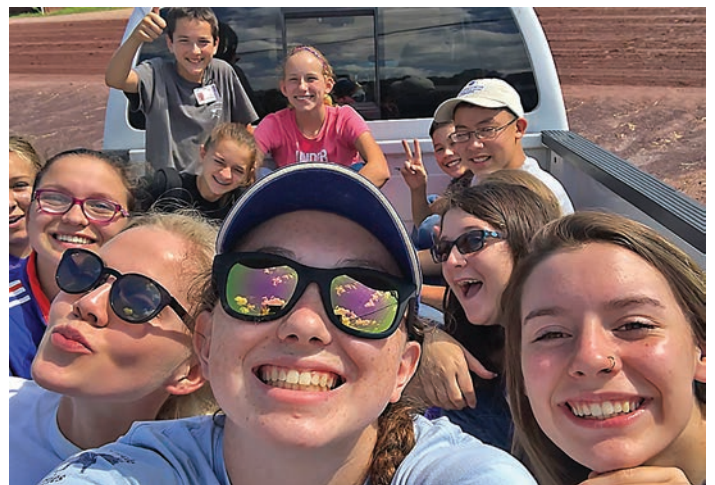
The Downs At Mohegan Sun Pocono Intro Camp - July 17 – 21 An opportunity for a group selfie!