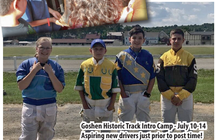
Goshen Historic Track Intro Camp - July 10-14 Aspiring new drivers just prior to post time!